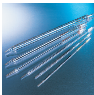
Corning offers sterile disposable glass and plastic pipets to eliminate the need for washing and sterilization.