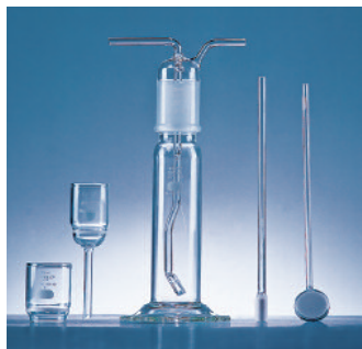
Fritted PYREX glassware requires special cleaning procedures to ensure the filter frits do not clog.

Many precipitates can be removed from the filter surface simply by rinsing from the reverse side with water under pressure not exceeding 15 lb/sq. in. Drawing water through the filter from the reverse side with a vacuum pump is also effective. Some precipitates tend to clog the pores of a fritted filter and may require special cleaning solutions (see Table 1).