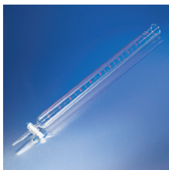
PYREX® Burets caption needed

Wash the stopcock or rubber tip separately. Before a glass stopcock is placed in the buret, lubricate the joint with stopcock lubricant. Use only a small amount of lubricant. Burets should always be covered when not in use.