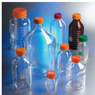
Corning offers a full selection of both reusable and disposable PYREX glass and plastic storage bottles designed to meet the stringent requirements of cell culture.

In laboratories where a large number of pipets are used daily, it is convenient to use an automatic pipet washer. Some of these, made of metal, are quite elaborate and can be connected directly by permanent fixtures to the hot and cold water supplies. Others, such as those made