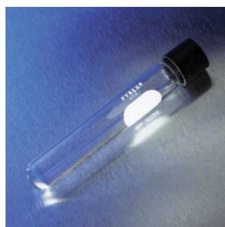
Corning offers both reusable and disposable glass culture tubes as well as sterile disposable plastic culture tubes