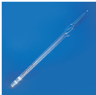
PYREX® Ostwald-Folin blood chemistry pipets must be carefully cleaned to ensure their accuracy.

To remove particles of coagulated blood or dirt, a cleaning solution should be used. One type of solution will suffice in one case, whereas a stronger solution may be required in another. It is best to fill the pipet with the cleaning solution and allow it to stand overnight. Sodium hypochlorite (laundry bleach) or a detergent may be used. Hydrogen peroxide is also useful. In difficult cases, use concentrated nitric acid. Some particles may require loosening with a horse hair or piece of fine wire. Take care not to scratch the inside of the pipet.