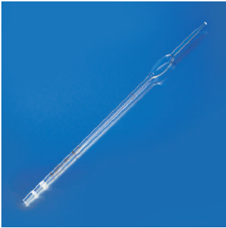
PYREX® Ostwald-Folin blood chemistry pipets must be carefully cleaned to ensure their accuracy.

To remove particles of coagulated blood or dirt, a cleaning solution should be used. One type of solution will suffice in one case, whereas a stronger solution may be required in another. It is best to fill the pipet with the cleaning solution and allow it to stand overnight. Sodium hypochlorite (laundry bleach) or a detergent may be used. Hydrogen peroxide is also useful. In difficult cases, use concentrated nitric acid. Some particles may require loosening with a horse hair or piece of fine wire. Take care not to scratch the inside of the pipet.